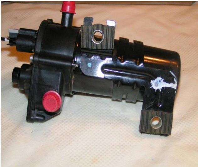
GM JC-4 Power Brake SBA Vacuum Pump

You may have a different pump on your coach, but you may want to check its operation so you know how much "Power Braking" you have. I no longer feel the standard JC-4 vacuum pump is a good upgrade. There are vacuum pumps available that can pump down to 20"+ of vacuum, These are used on Diesel, Hybrid and Electric vehicles where engine vacuum is not available. This vacuum level will give you good braking in case of an engine stall (assuming your chassis battery still has normal power capacity) Dave Lenzi had a line on a Ford pump, but has advised me that currently he has supply issues for this pump.