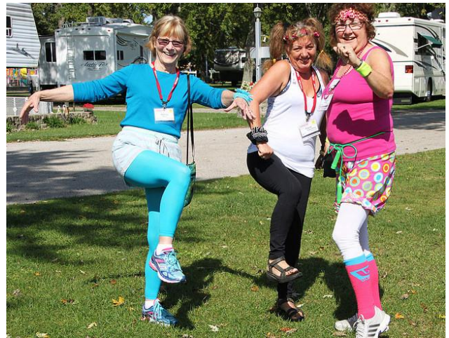
On the Way to Exercises !!

September Rally – We had our last rally of 2017 at the GMCMI Convention in Elkhart, Indiana. There were 19 Heritage Cruiser couples in attendance out of 199 attending the Convention. Other than a few moments of rain we had very good weather in a great campground.