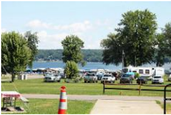
Beautiful Area at Chautaugua, NY