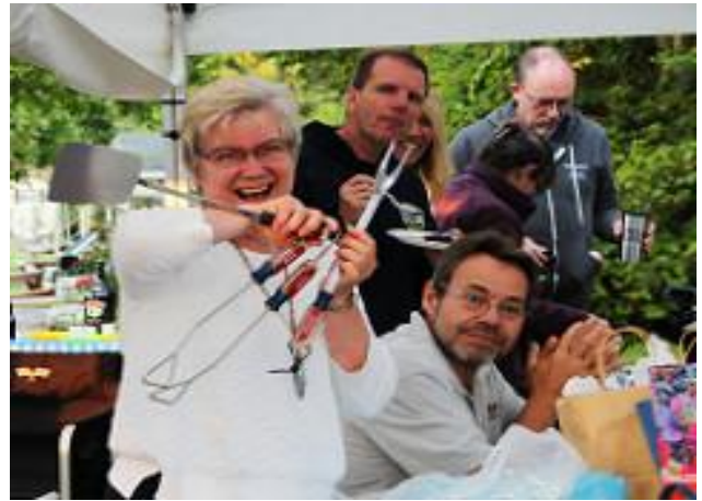
Armed & Dangerous !!