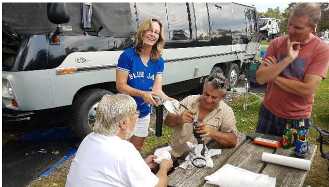
Grease Monkey !!