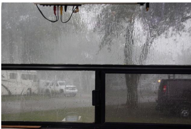
A Little Rain !!!