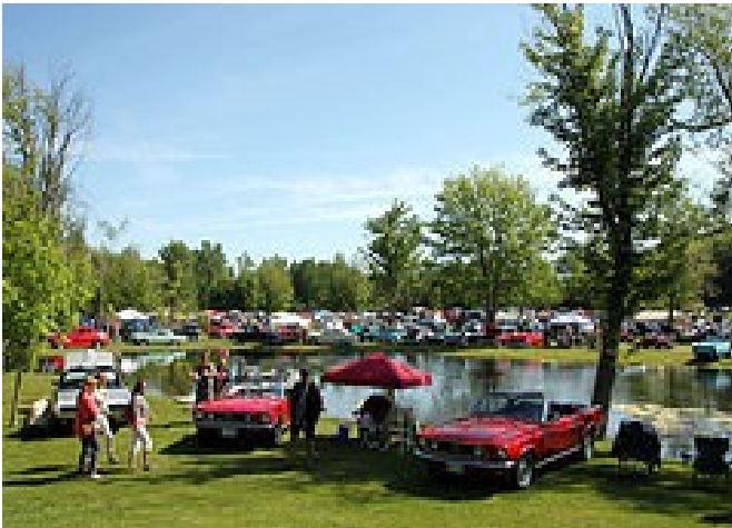
A Few of the 4000 !!!