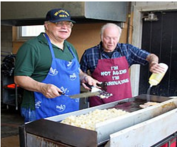
The Chefs !!