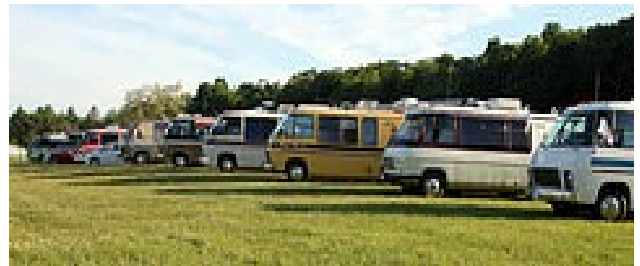
All lined Up Again