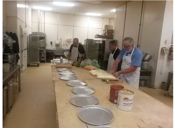
Pizza Assembly Line