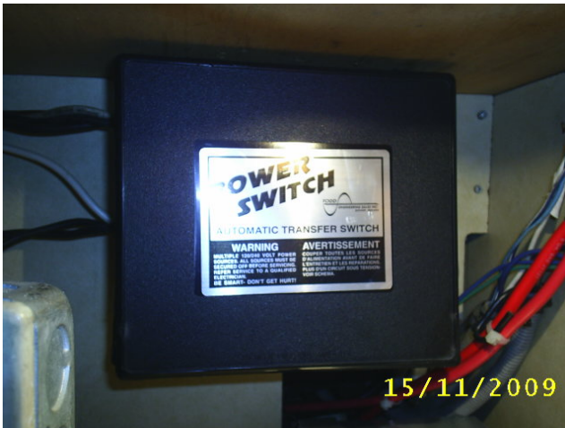
Automatic Transfer Switch

Finally, a battery combiner replaced the battery isolator at the front of the coach. It allows the converter to keep all the batteries charged when a 120 volt source is available, whether it is shore power or generator. The voltage loss across the combiner is very small compared to a isolator, so it's more efficient.