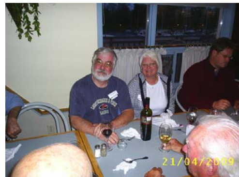
Two more happy campers!!!