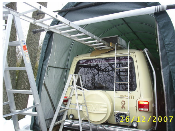
Looks easy doesn't it!!!!

Most folks use a fork lift to remove a 120-pound roof air conditioner from their coach. Here is how one GMC owner did it !!!