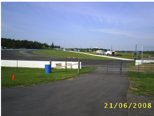
Turn Eight, Mosport – Our View of the Races